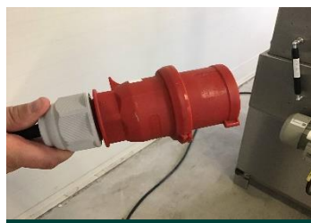
415 volt 32amp 3 phase Neutral & Earth power supply