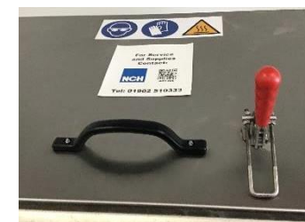
Insulated locking handle