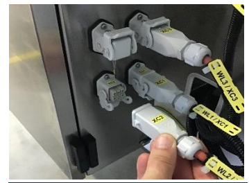
Quick Connection Component Exchange