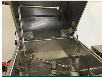
Top, Bottom and Side Spray Booms