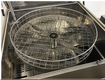
Size perspective of basket