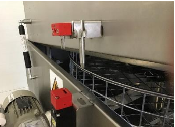
Safety interlock mechanism